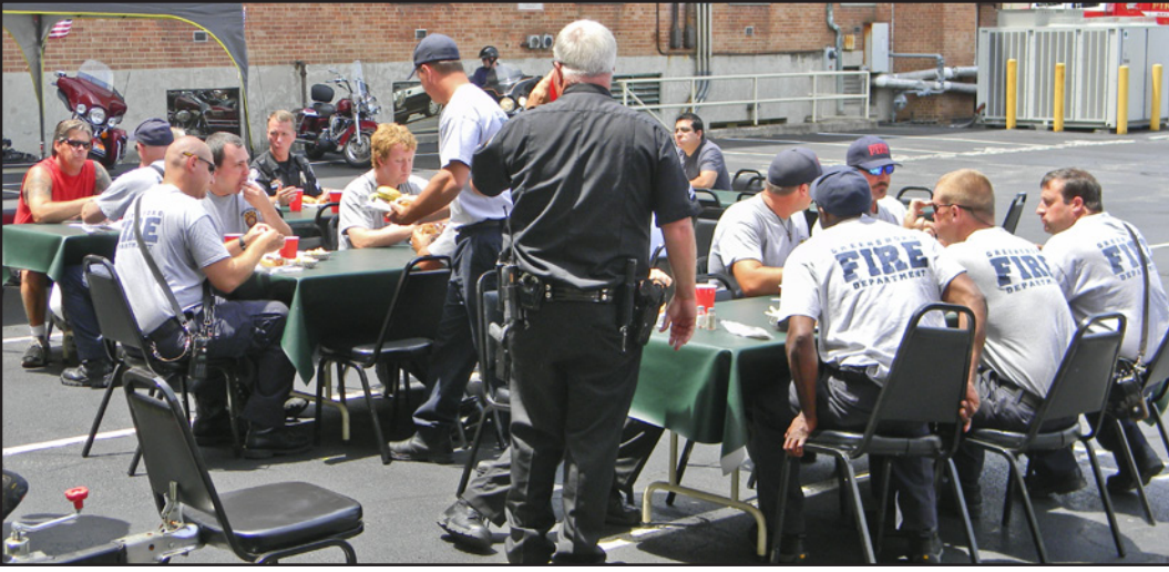
Picnic in the parking lot.