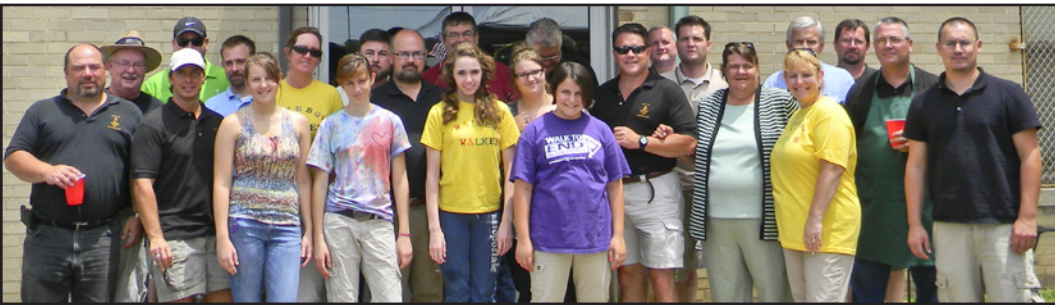
Here are the volunteers who made the thank you possible.