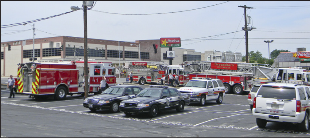
The parking lot looked like a disaster when Greensboro 76 saluted local emergency personnel.