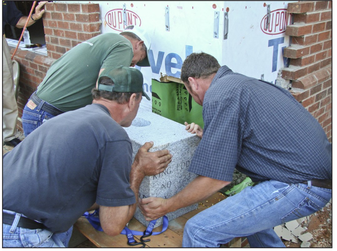
King 722's cornerstone is muscled into its proper position.